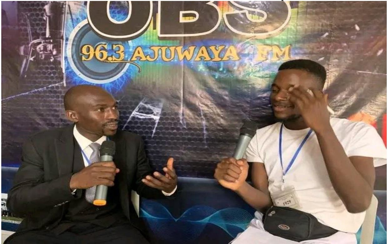
At Wannune NYSC Orientation Broadcasting Service Studio Delivering a 30 Minute interview on the Sickle Cell Anemia Advocacy.