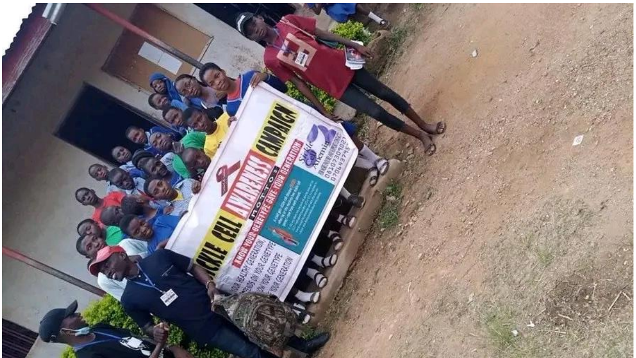
ON THE 23 RD JUNE, 2021 AT THE UNIVERSITY OF JOS, MEDICAL CENTER, JOS, PLATEAU STATE.