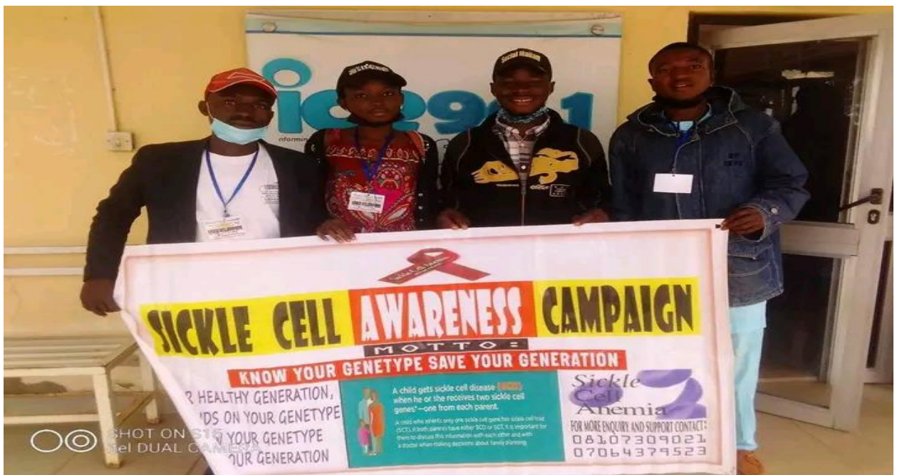
At Ice where we had a discussion on Sickle Cell Anemia to Commemorate the World Sickle Cell Awareness day. 2021