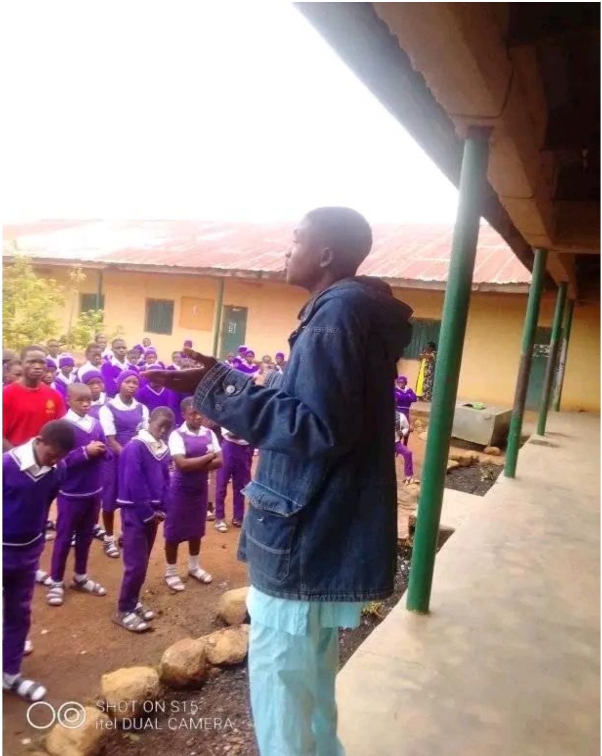
Addressing Students and Staff on the Assembly ground at GSS, Gwong on Sickle Cell Anemia and the need to know their Genotype and of their partners as that will help them know the fate of their relationship.

18 TH JUNE, 2021 AT GOVERNMENT SECONDARY SCHOOL CHWELNYAP NASARAWA GWONG, JOS NORTH LGA, PLATEAU STATE.