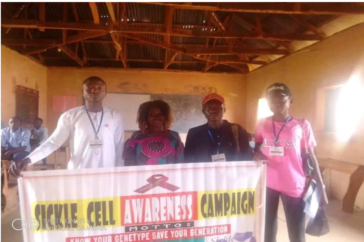
2. ON the 14 th June, 2021. Addressing Students and Staff on the Assembly ground at GSS, Gwong Opposite Senior Staff Quarters University of Jos. Plateau State.