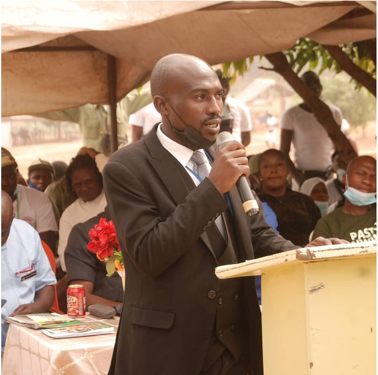
On the 11 th of December, 2021 addressing Nysc Corps Members, Staff of the NYSC Scheme and The entire Camp community on Sickle Cell Anemia.