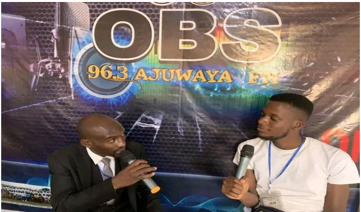
Discussing Sickle Cell Anemia after my presentation during the SAED Lectures. This platform avail me the opportunity to emphasize on the certain issues especially as it relate to compatibility as well as address issues I didn't cover before. We had a 30 minutes discussion over therein.