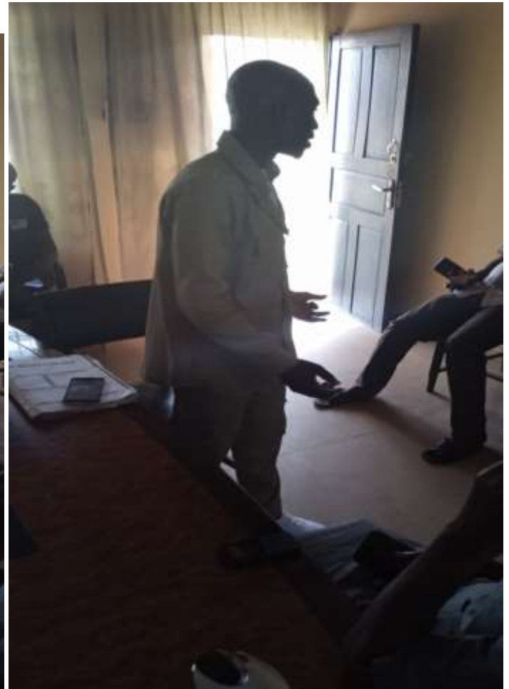
Addressing Staff of the department on sickle Cell Anemia exposing their roles in the fight against the spread of the sickle cell anemia.