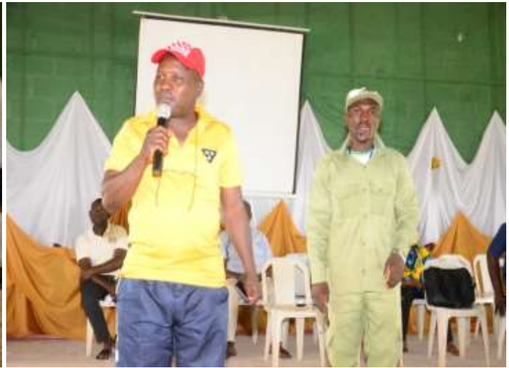
Presenting at the Nysc Camp. after the my presentation I proceeded to OBS, I.e the camp Orientation Broadcasting Service where I secured a slot for the medical Doctors in camp to go talk about the Medical Condition of which they were given an hour to discuss on the disease which they did.