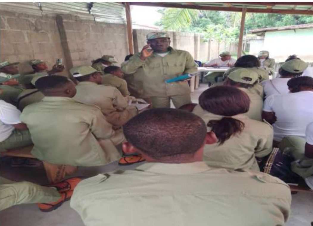
Addressing fellow Corps Members on sickle Cell Anemia exposing their roles in the fight against the spread of the sickle cell anemia and the need for ensuring compatibility