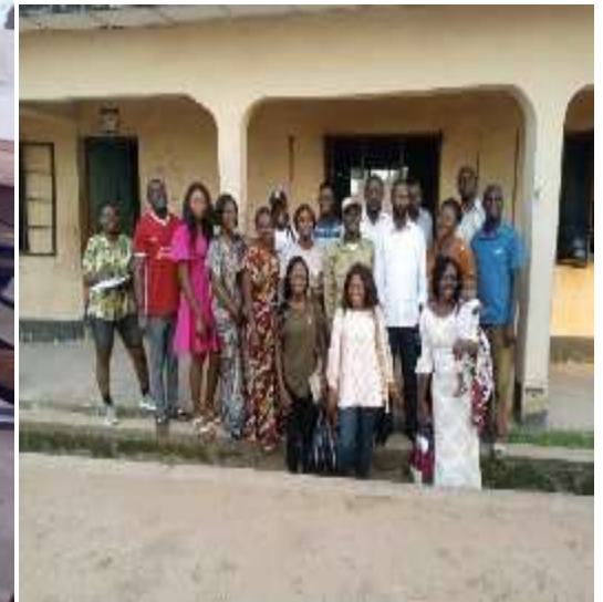
Addressing Detachment 12 Red Cross Volunteers and Members on sickle Cell Anemia exposing their roles in the fight against the spread of the sickle cell anemia.