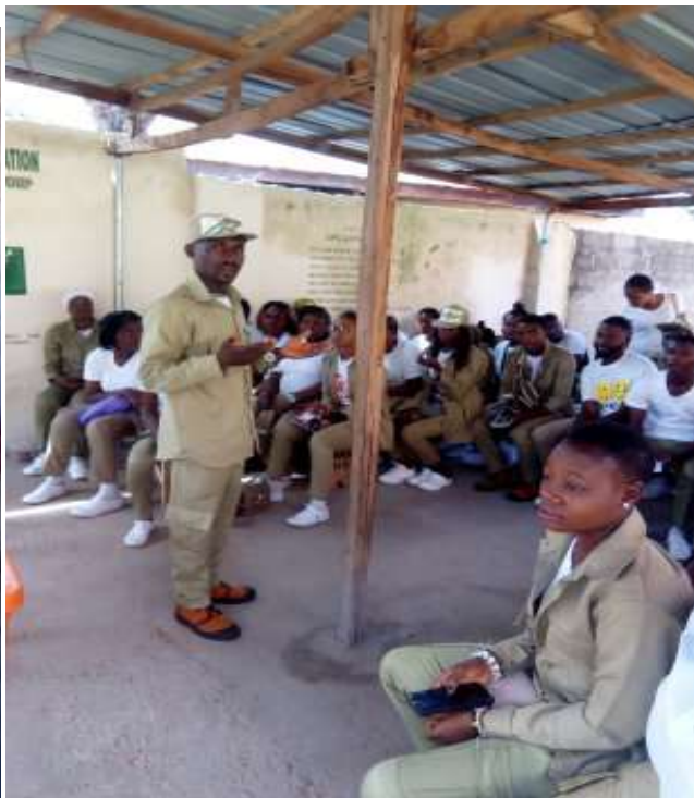
Addressing the CDS Group on sickle Cell Anemia exposing their roles in the fight against the spread of the sickle cell anemia and the need for compatibility.