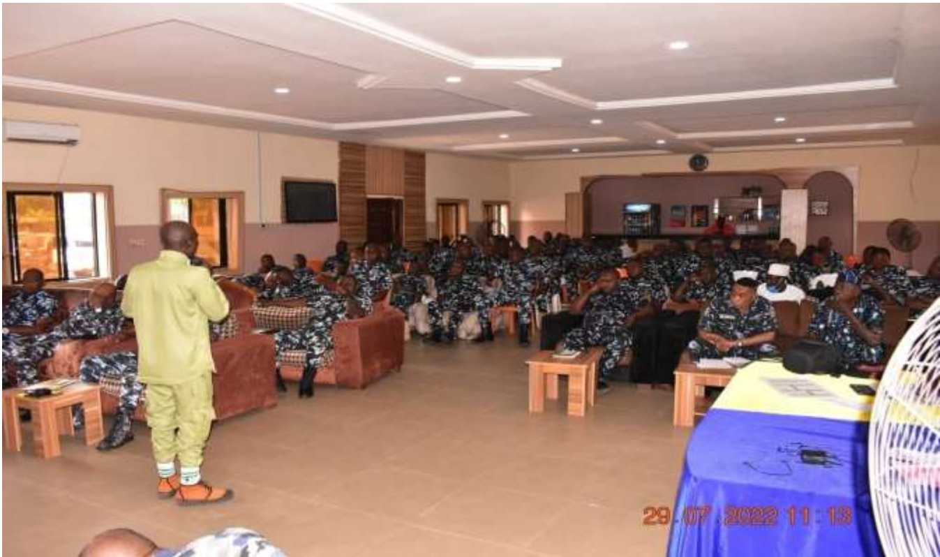
Addressing Officers at Police Officers Conference on their roles in the fight against the spread of Sickle Cell Anemia, especially as Parents and Grandparent exposing why the condition still persist in our community.