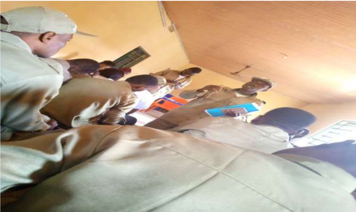
Addressing fellow Corps Members on sickle Cell Anemia exposing their roles in the fight against the spread of the sickle cell anemia and the need for ensuring compatibility