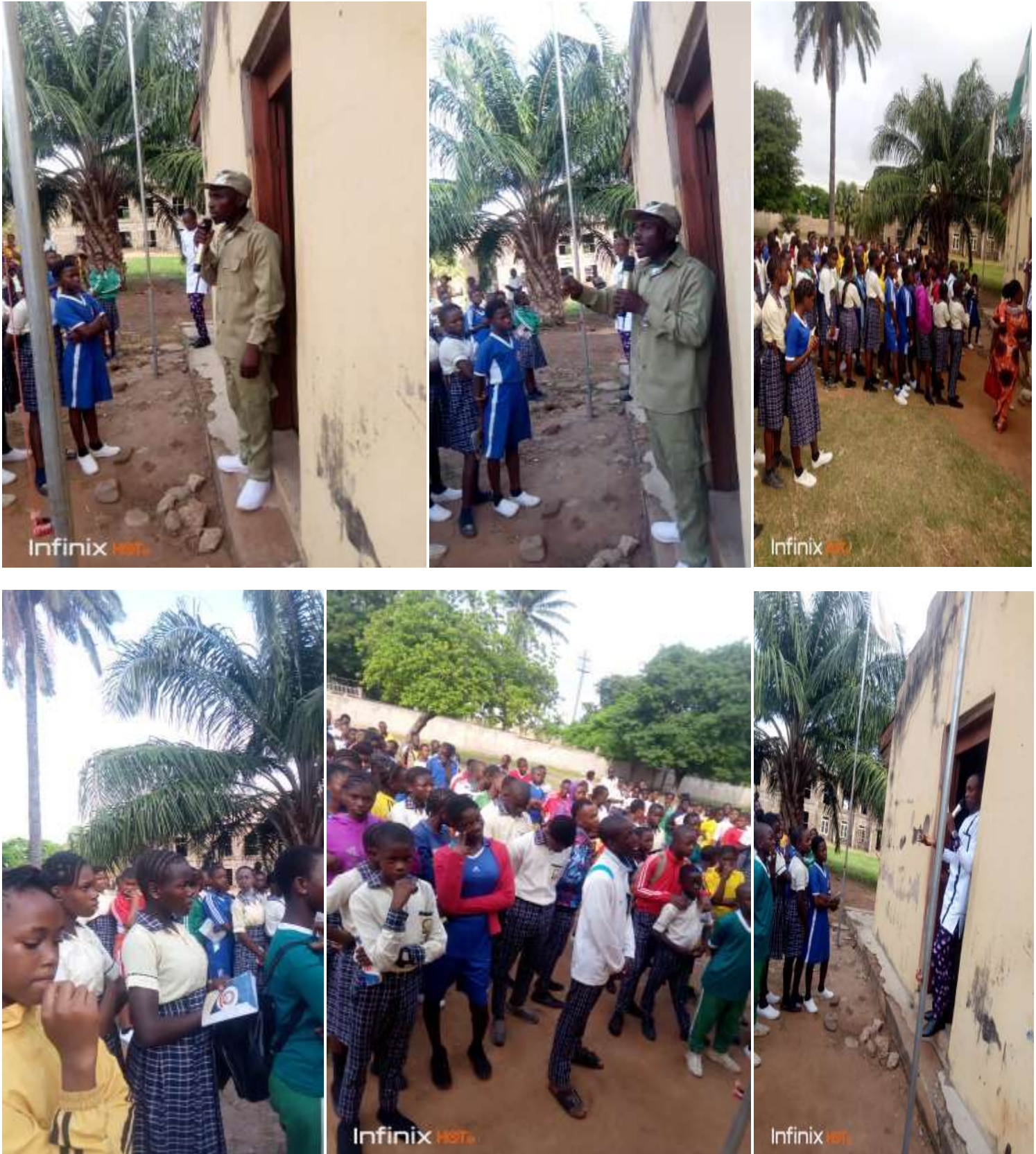
Addressing Students and Staff on sickle Cell Anemia exposing their roles in the fight against the spread of the sickle cell anemia.