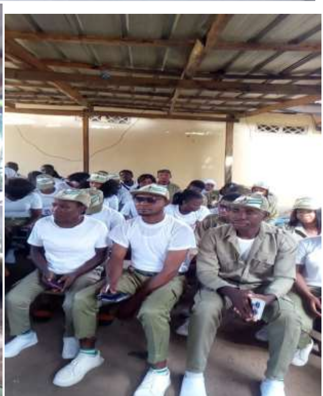
Addressing my fellow corps members on their role in the fight against the spread of Sickle Cell Anemia