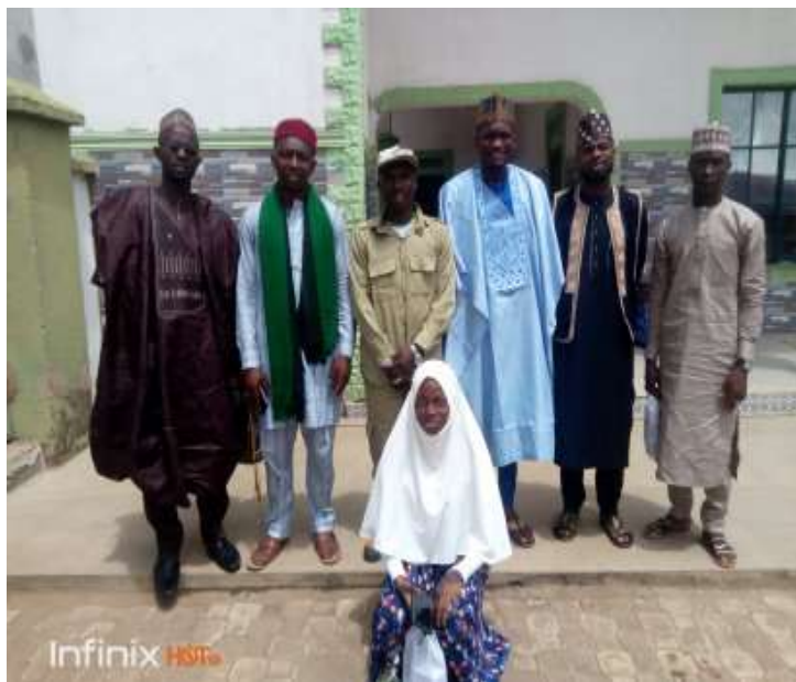
Discussing sickle cell anemia to the dignitaries and invited guests on Sickle cell anemia exposing why sickle cell anemia still persists as well as their roles in the fight against the spread of Sickle Cell Anemia regardless of Profession, Age and Marital Status.