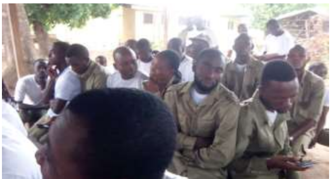
Addressing my fellow corps members on their role in the fight against the spread of Sickle Cell Anemia