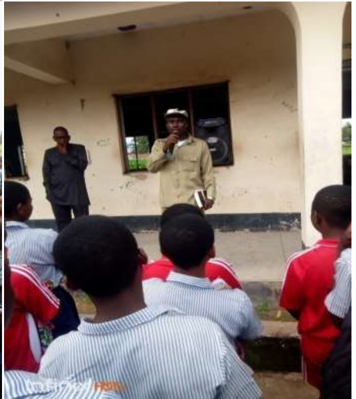
Addressing Students and Staff on Assembly ground on sickle Cell Anemia exposing their roles in the fight against the spread of the sickle cell anemia.