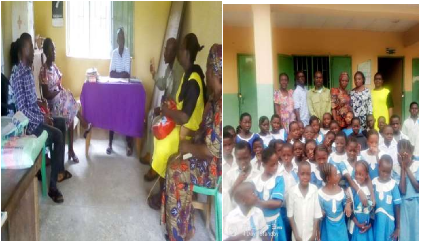
Addressing Students and Staff on Sickle Cell Anemia exposing their roles in the fight against the spread of the sickle cell anemia.