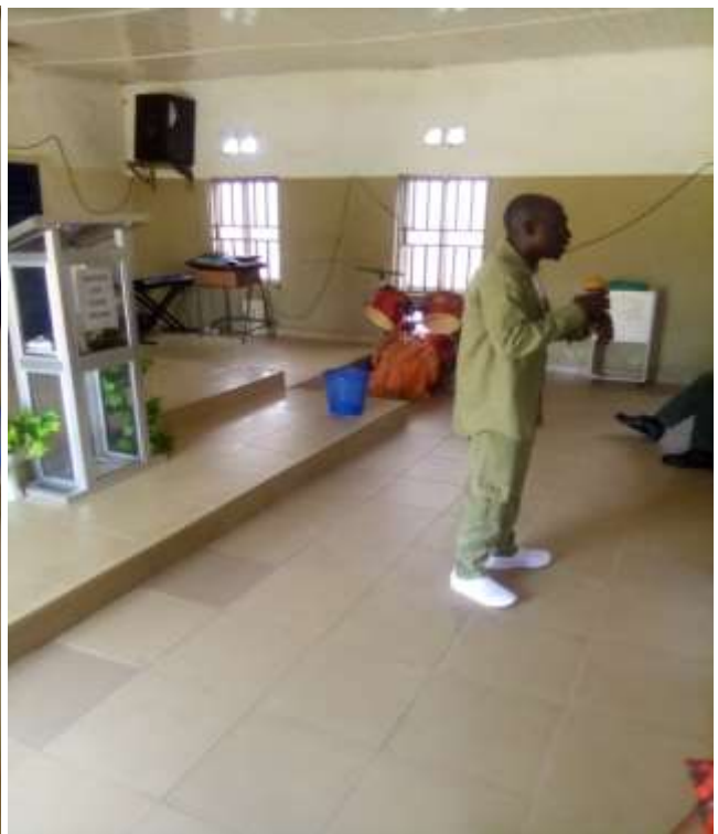
Discussing sickle cell anemia to the congregation exposing why sickle cell anemia still persists as well as their roles in the fight against the spread of Sickle Cell Anemia as parent.