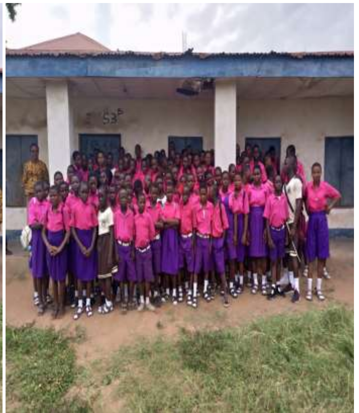
Addressing Students on sickle Cell Anemia exposing their roles in the fight against the spread of the sickle cell anemia.