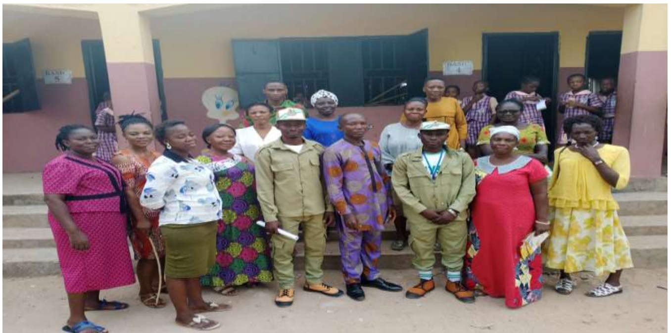
A talk on Sickle Cell Anemia at Methodist Primary School, South Bank. On the 1 st June, 2022. Where I discuss sickle cell anemia to both staff and students and their roles in the fight against its spread.