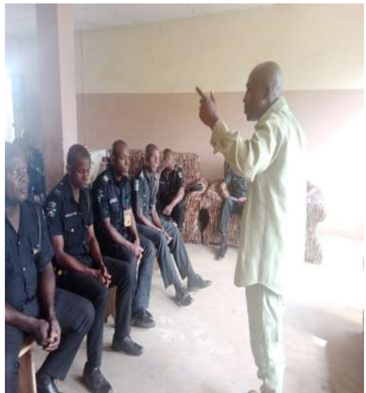
On the 7 th June, 2022. At the Department of Logistic and Supply, Nigeria Police Force, State Police Headquarters, Makurdi, Benue State. During their routine Morning briefing addressing all the service men and women on their role in the fight against the spread of sickle cell anemia.