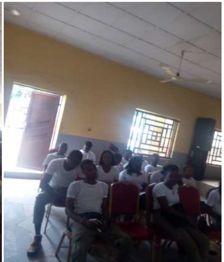
Addressing Students, Staff and Medical CDS Members on sickle Cell Anemia exposing their roles in the fight against the spread of the sickle cell anemia.