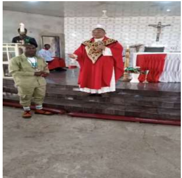
Discussing sickle cell anemia to the congregation exposing why sickle cell anemia still persists as well as their roles in the fight against the spread of Sickle Cell Anemia regardless of Profession, Age and Marital Status.