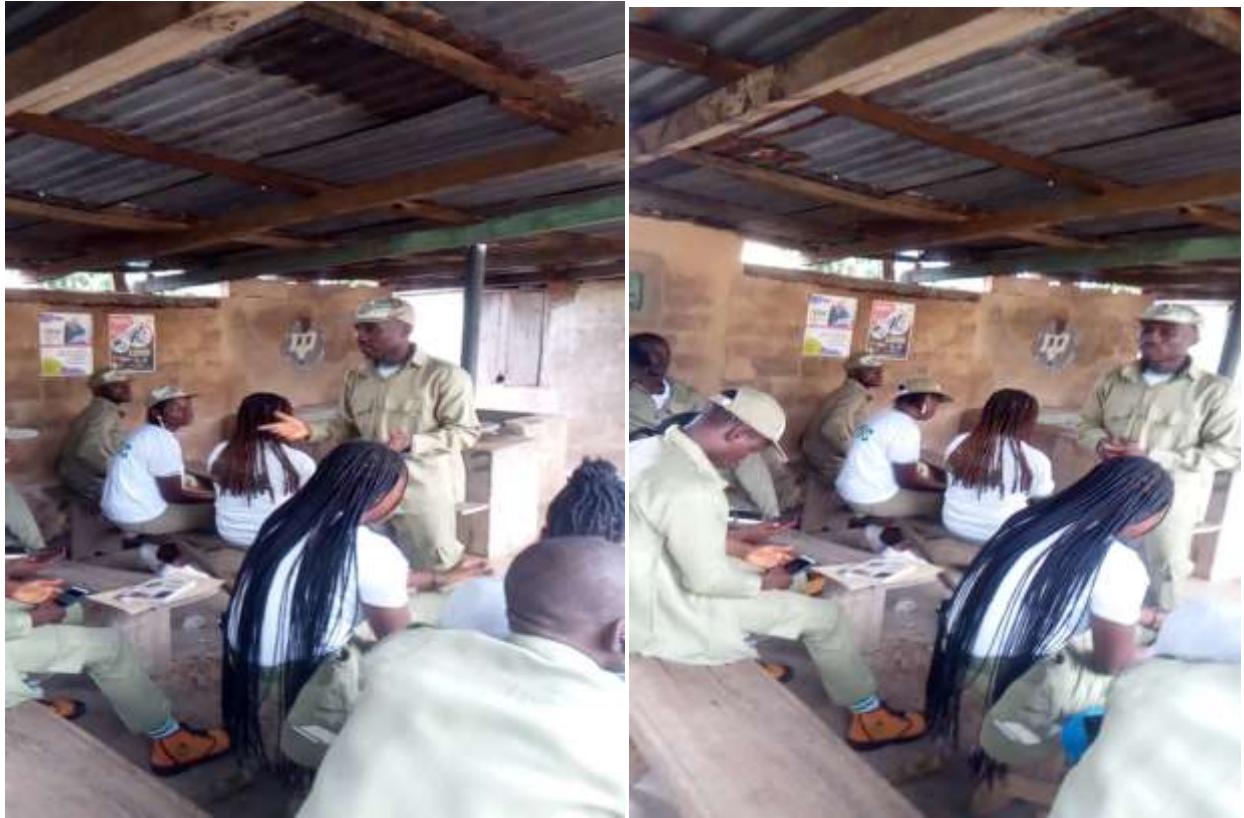
Addressing my fellow corps members on their role in the fight against the spread of Sickle Cell Anemia at the Legal Aid CDS Group